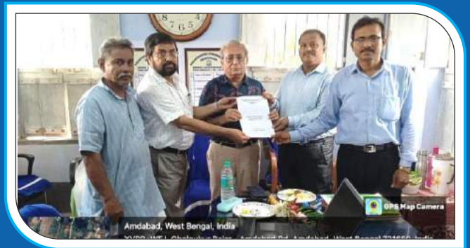
Green Audit Team, 2024