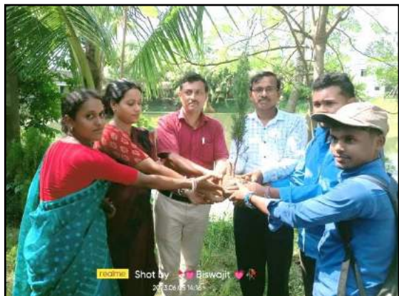
Observation of World Environment Day, Education Department-2023