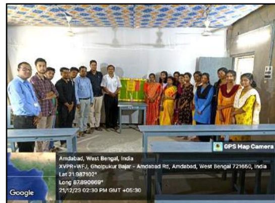
Publication of Wall Magazine, Sociology Department, 2023