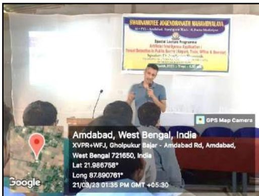
Special Lecture Programme on Artificial Intelligence-2023