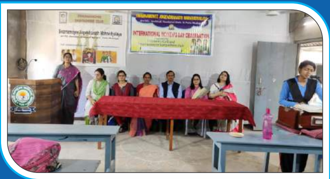
International Women's Day Observation, 2024