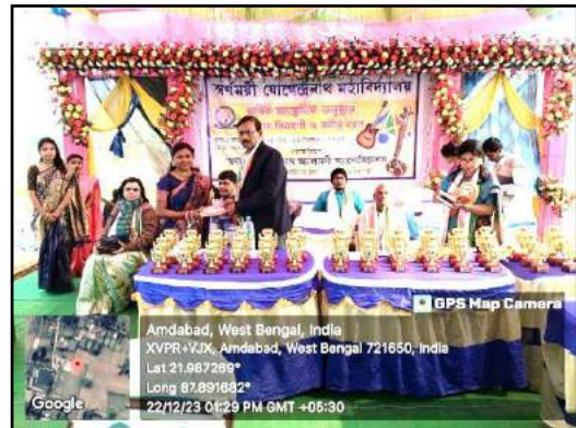
Annual Cultural Programme & Prize Distribution Ceremony, 2023