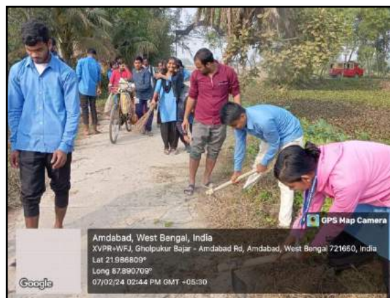
Safai Abhijan of NSS Volunteers-2024