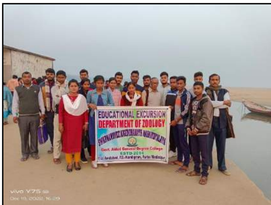
Field Survey at Digha Coast, Zoology Department, 2023