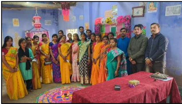
Publication of Wall Magazine, Sanskrit Department, 2023