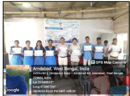
Workshop on Students' Credit Card, 2023