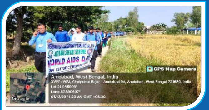
Awareness Rally on AIDS, 2023