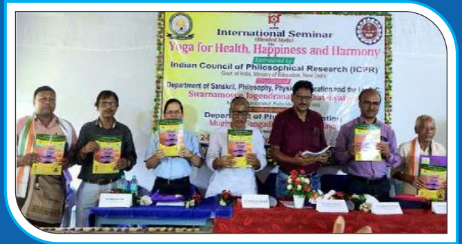
International Seminar on Yoga-2023