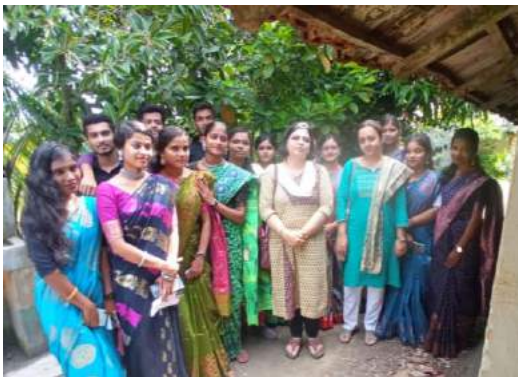
On the Occasion of Farewell Ceremony of 6 th Sem. Students, English Department, 2023