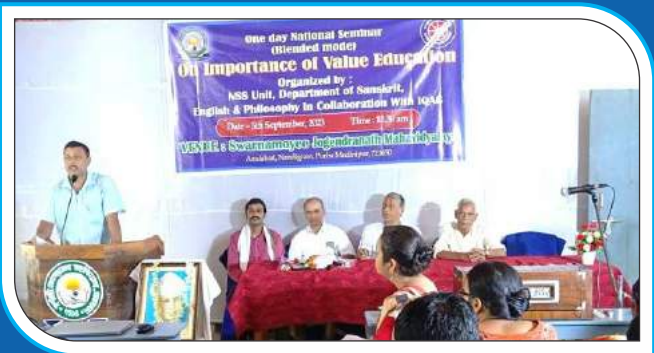
Seminar on Value Education-2023