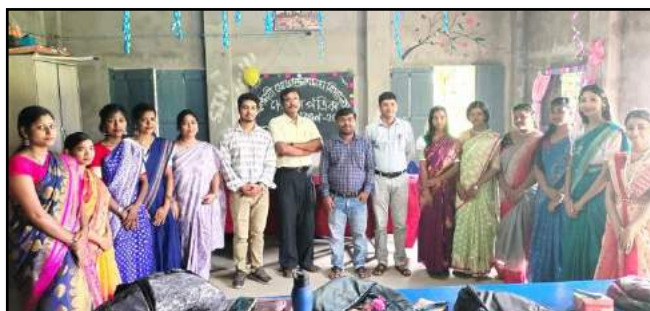
On the Occasion of Wall Magazine Publication, Geography Department, 2024