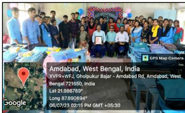
Farewell Ceremony of 6 th Sem. Students, Bengali Department, 2023