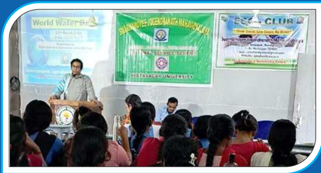
Observation of World Water Day-2024