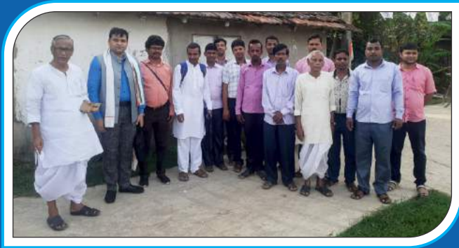
Non-Teaching Staff with G.B. Members & Guests