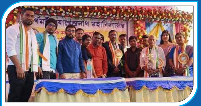
Members of Alumni Association- 2024