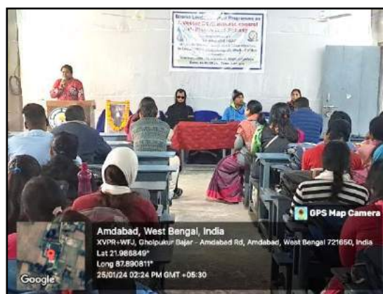
Seminar on Vector Borne Disease, 2023